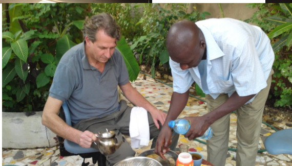
Cultural exchange in the art of cooking tea