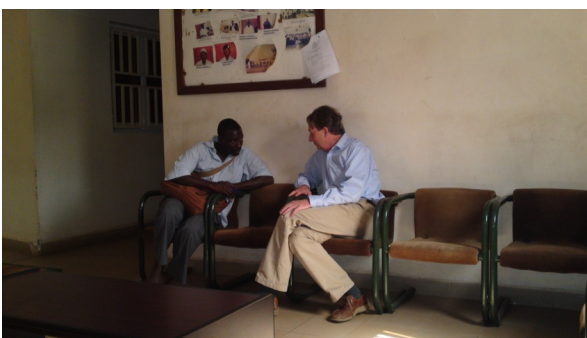
Waiting at RVTH