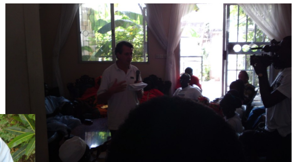
Talking to potential patients